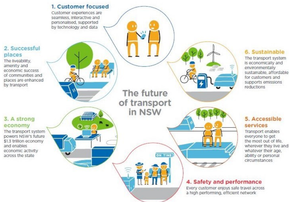
Figure 1: Outcomes – The Future Transport Strategy

Source: p15, Future Transport Strategy , March 2018, TfNSW