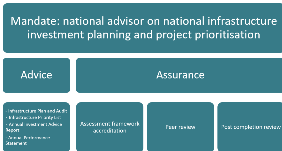
Figure 1: Infrastructure Australia mandate and core roles

As part of redefining its mandate as the national infrastructure advisor, the Review recommends Infrastructure Australia's broad responsibilities focus on two areas: advice and assurance .