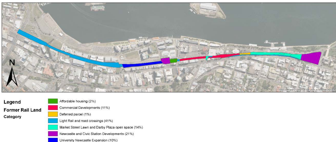
Exhibit 7: Map of projects on the former railway land

Program planning documents stated that closing the train line at the Western edge of the city was crucial to achieving the objectives of the Program. Several projects are being planned that involve repurposing the former railway land for economic and community uses. Exhibit 7 shows the main projects on the former railway land and Exhibit 8 describes these projects. These developments have not been finalised. In this chapter, we assess the processes used to decide on uses for the former railway land, but do not assess whether the objectives have been achieved.