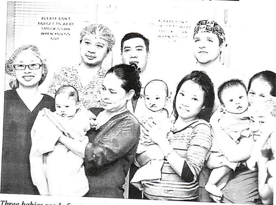
Three babies ready for surgery and a second chance in the morning line-up.

Operation Restore Hope (ORH) is in its 20th year of operating having commenced in 1994 in Cebu, in the Visayas region of the Philippines. Having now completed more than 2,300 operations and provided countless other medical services, especially dental, we continue to field three surgical missions per year to the Philippines: 2 to Cebu and 1 to Luzon.